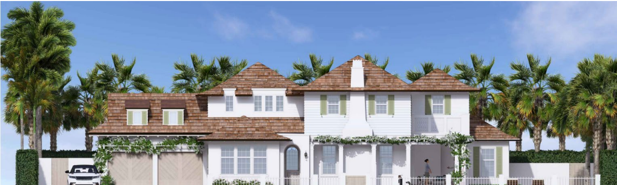
Previous proposal front elevation

Since the prior submittal, the applicant has revised the form of the roof of the one-story front element, modified the dormers above the garage, and further reduced the second floor massing along the east side of the proposal—among other revisions.