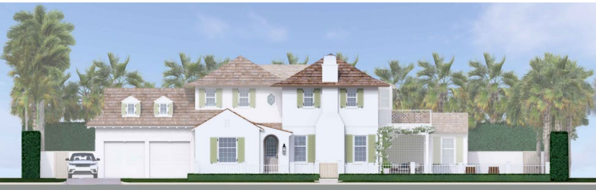
Current proposal front elevation