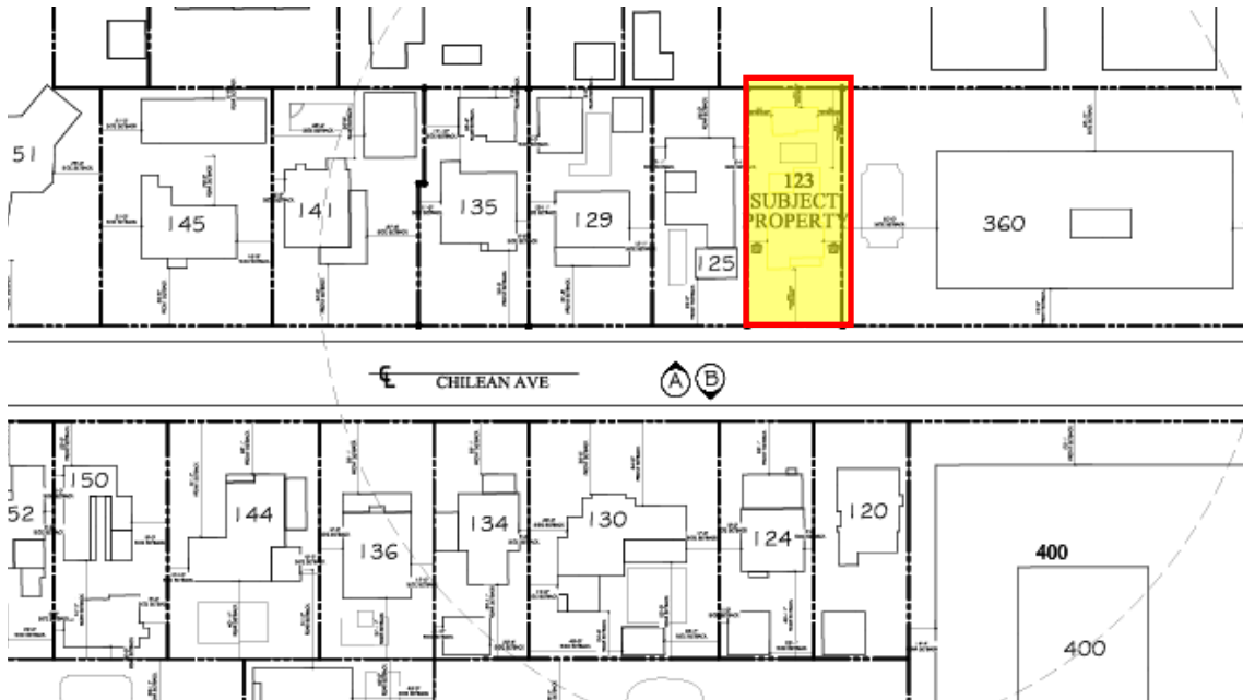
Current neighborhood conditions