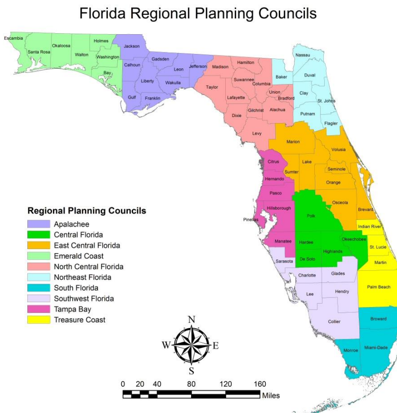
Exhibit 12-1 Regional Planning Councils