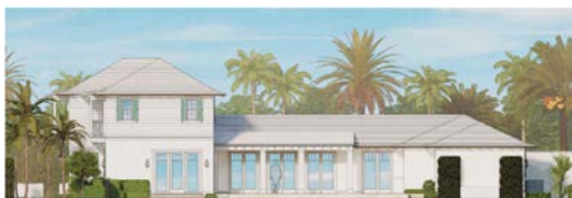
WEST ELEVATION - PREVIOUS SCALE: 1/8"=1'-0"