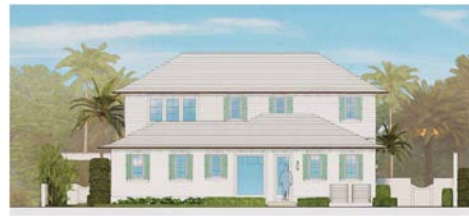
SOUTH ELEVATION - PREVIOUS SCALE: 1/8"=1'-0"