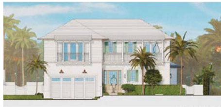
NORTH ELEVATION - PREVIOUS SCALE: 1/8"=1'-0"

The applicant has resubmitted plans to address concerns of the commission. The applicant has resubmitted plans where the two-story massing at the front of the structure has been shifted. The location of the garage and entry remain the same on the plan, however, the garage and second story above are now stepped back from the entrance of the home. A covered entry is re-introduced for the main entrance. The second-floor balconies previously proposed have been eliminated. A second story bay window is now proposed over the garage in lieu of the balcony. The footprint of the home was modified slightly to allow for the changes, but overall, the site programming remains similar. Equipment is split between two enclosed equipment yards on the east side of the house and the south rear, with one A/C unit proposed at the front west corner of the home (outside of the setbacks). Landscape adjustments have been made to accommodate the redesign.