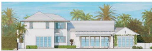
WEST ELEVATION - CURRENTLY PROPOSED SCALE: 1/8"=1'-0"