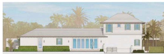
EAST ELEVATION - PREVIOUS SCALE: 1/8"=1'-0"