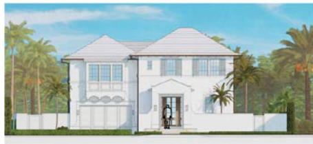
NORTH ELEVATION - CURRENTLY PROPOSED SCALE: 1/8"=1'-0"