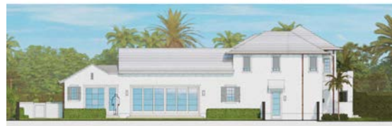
EAST ELEVATION - CURRENTLY PROPOSED SCALE: 1/8"=1'-0"