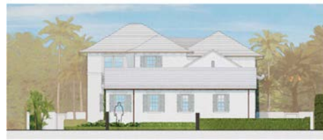
SOUTH ELEVATION - CURRENTLY PROPOSED SCALE: 1/8"=1'-0"