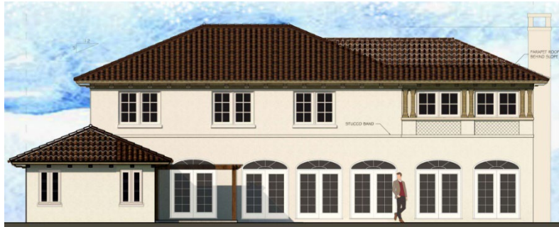
November Rear Elevation

Modifications are also proposed to the second story rear addition. The applicant is now requesting to utilize a new parapet roof configuration which applies barrel tile slopes to the south and east sides in order to help integrate the addition into the primary roofline.