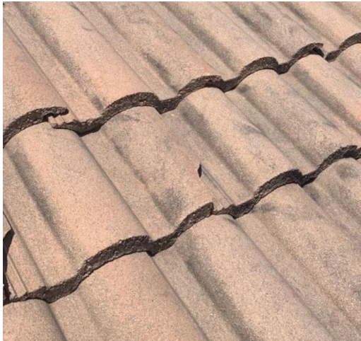
Existing Concrete Simulated Barrel Tiles

The structure was built in 1989 and is firmly hidden from view by dense landscaping at the front of the property and generous setbacks. The application requests to replace the existing concrete simulated barrel tile roof with new Terracotagres “Brastile” clay “S” tiles in a variegated color blend of Terracotta, Coffee, and Red, as depicted below: