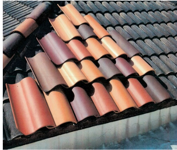
Proposed Clay “S” Tiles in Color Blend

Additional photos of the property and literature on the requested roofing material are included in the plan miniset.